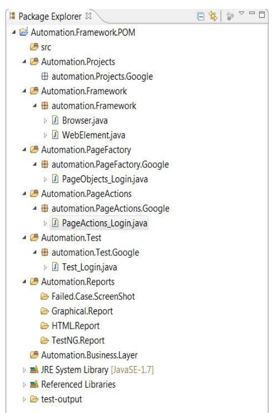
Fig 2: Framework Structure